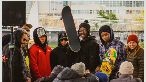
Volunteers from Youth Enrichment Services (YES) received skateboards at the Lynch Family Skatepark grand opening. The volunteers earned the skateboards by working with the Conservancy Volunteers Program.

Until now, there has never been a designated area to skateboard around Boston, frustrating skaters, parents and members of law enforcement."