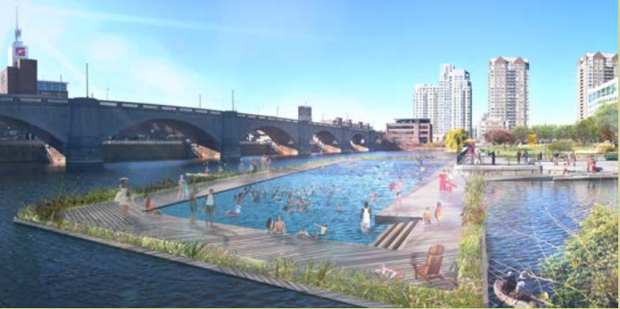
Feasibility Study Rendering by Stantec for the Conservancy.