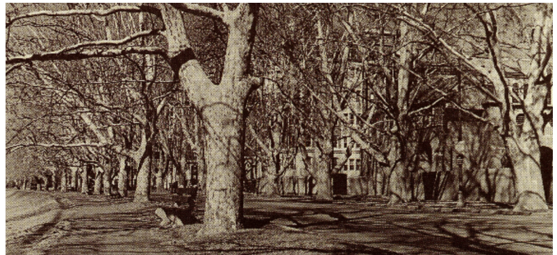
The iconic Sycamore Allée 1999