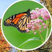
Asclepias incarnata (Swamp milkweed)

Your gift helps this unique ecosystem thrive!