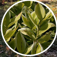
Polygonatum biflorum (King Solomon's seal)