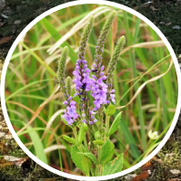
Verbena hastata (Blue vervain)