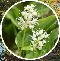
Maianthemum canadense (Canada mayflower)